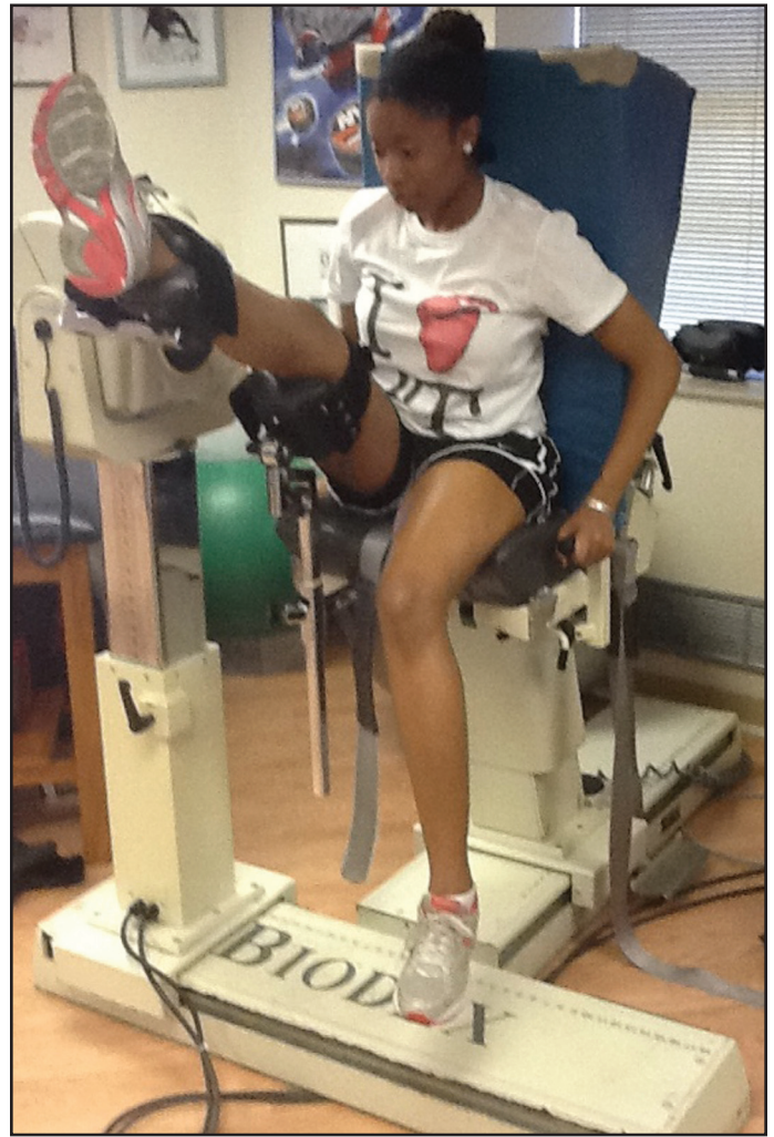
Figure 4. Lengthened state eccentric training on the Biodex™.