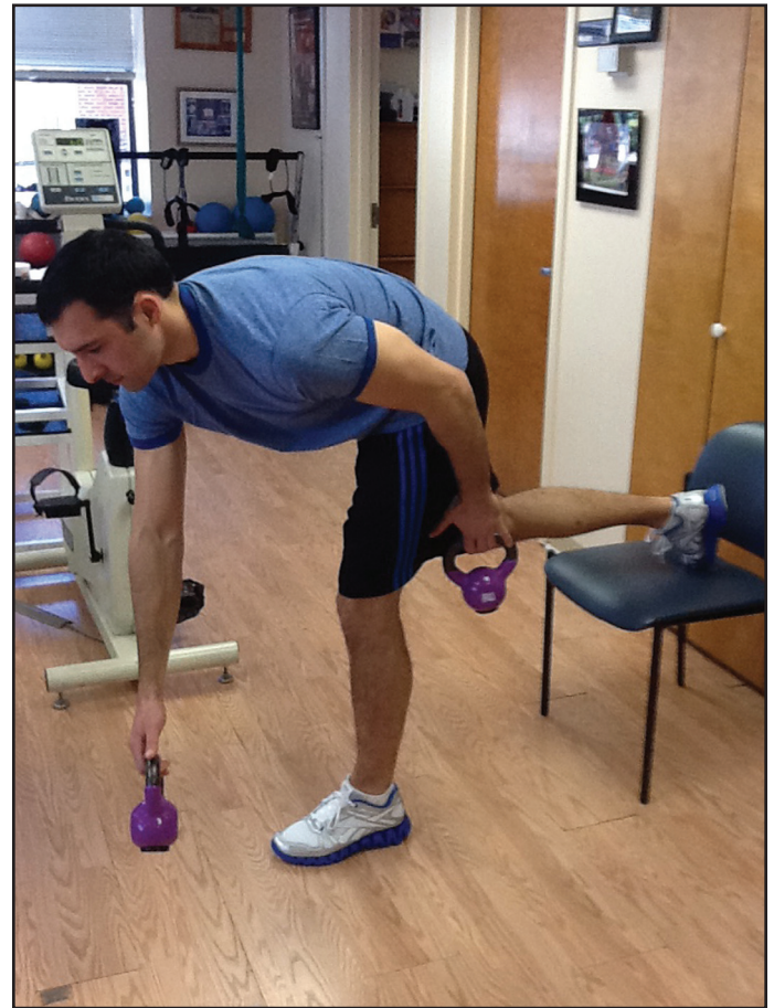
Figure 2. Single leg eccentric hamstring windmills, which can be performed without (early) weights and progressed to use of hand-held weights or kettlebells, as shown.

the recurrence rate remains disproportionately high. There is little evidence suggesting a valid functional test to determine return to play status after hamstring strain, which may mean rehabilitation professionals are returning athletes to competition before they have regained full strength in the lengthened hamstring position. In this regard Askling et al 38 recently described a dynamic straight leg raise flexibility test, termed the H-test (Figure 6), to identify residual functional impairments that would preclude return to play. To perform the H-test, hamstring flexibility was calculated using data collected using an electrogoniometer during active ballistic hip flexion and conventional passive slow hip flexion while in a supine position. A VAS-scale (0-100) was used to estimate experience of insecurity during active tests. Patients with hamstring injuries who were thought to be ready to return to sports based on standard clinical assessment demonstrated deficits in dynamic flexibility with the H-test despite having normal passive flexibility. The subjects also reported subjective insecurity while