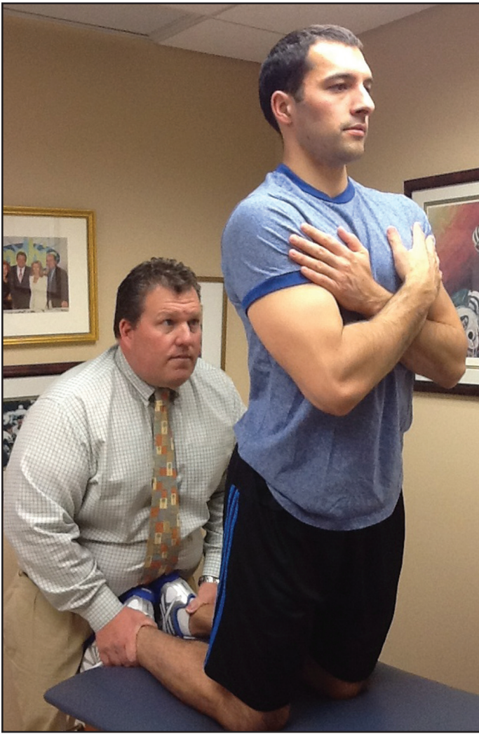
Figure 3. Nordic hamstring exercise.