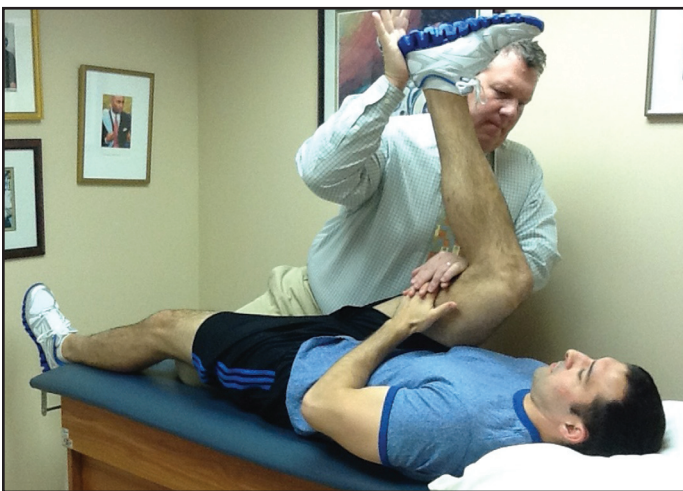
Figure 7. Lengthened state manual muscle hamstring test.

Hamstring injuries have long been the bane of athletes' participation in sport among those who engage in sprinting and explosive movements, primarily because of both the high occurrence and recurrence rates. These injuries appear to create subsequent weakness at the muscle's lengthened state, predisposing the athlete to further injury. Lengthened state eccentric training may increase the end range