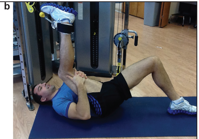
Figure 5 a,b. Lengthened state eccentric training on cable column.