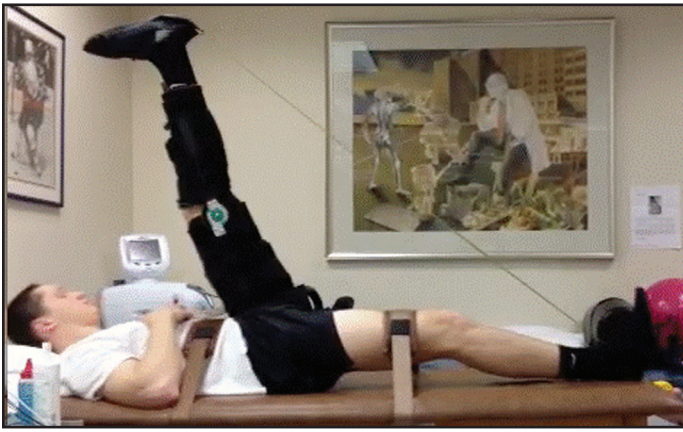
Figure 6. Dynamic hamstring flexibility test (H-test).

remains flat on the table. The clinician then passively extends the knee until met with soft tissue resistance (i.e. putting a stretch on the hamstring). The clinician backs off by allowing the knee to flex 10 degrees from maximal stretch (Figure 7). From this position the clinician conducts the break test of the hamstring, and grades it using the tradition 0-5 scale established by Kendall or objectively by using a handheld dynamometer.