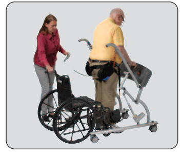
With the protection of a safety harness, the mobility-assist device lifts patients from a seated to standing position.