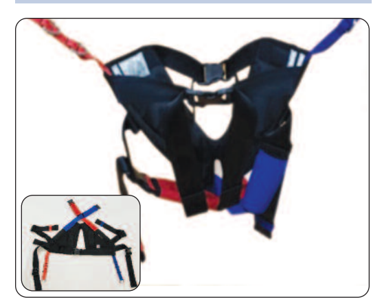
NEW Closed-Seat Harness The full seat of our redesigned safety harness supports patients securely and comfortably. Easy-to-read labels and color coding make the harness simple to put on and adjust, saving precious time for therapists and nurses.