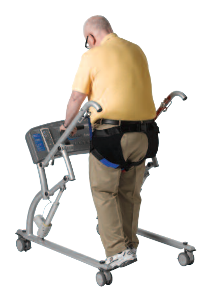
The closed-seat safety harness securely supports patients during lift and ambulation.

Neurologic conditions SPHM Older adult Senior rehab Orthopedic