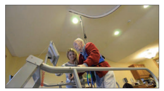
With a patient in the FreeStep, we can give tactile cues that we would not be able to provide without the protection of the harness.

For example, we had a patient who started in a wheelchair, but with our rehab, she became strong enough where she could walk without her walker. Good, but a potential problem: Since she had dementia, she left her walker in her room all the time, and the staff would find her walking without it. Our goal was to get her steady enough to walk without an assistive device at all. In that case, we put her in the harness, we had her walk over obstacles, up and down