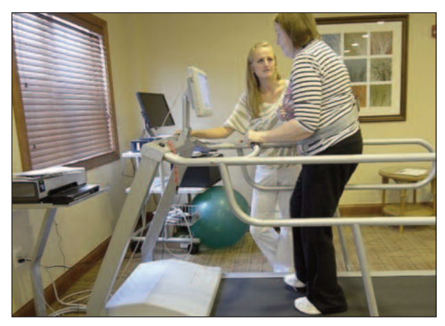
Audio feedback on the Biodex Gait Trainer 3 serves as a metronome to foster equal step length.

When we got our new Biodex equipment, we started a more detailed Gait Training routine with her. While she walks, we turn on the audio feedback so she can hear when her steps are occurring. We are trying to get her step length and her weight bearing to equal out on both sides so that she is using that affected limb more.