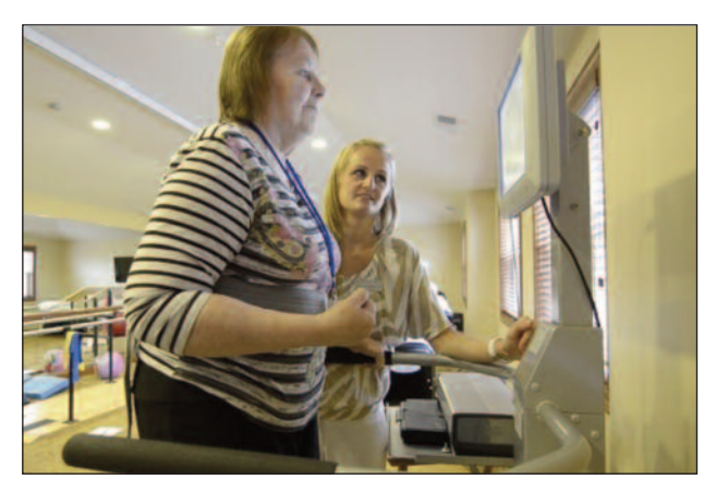
Visual feedback helps stroke patients become more aware of their gait pattern and their affected side, learning to trust in its strength.

In addition to the Gait Trainer audio feedback, she can see the percent weight bearing on each leg and compare the two; we get excited when we see those numbers come closer and closer to 50% on each leg. She is also looking at the covariance, how her step changes as she walks. As her affected limb becomes fatigued, does it take shorter steps? As she tires, is it handling less of the weight bearing than it was before? The display on the Gait Trainer lets her see when she is taking big steps. She has been able to normalize step length on the Gait Trainer, so her steps are exactly equal now at this time.